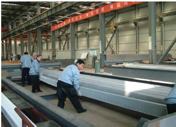
Single-row manufacturing facility