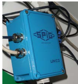
UNICO installation on an air-cooled condenser