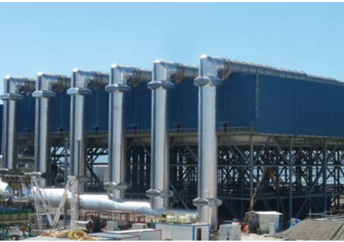
Air-cooled condensers for an 850 MW combined cycle power plant