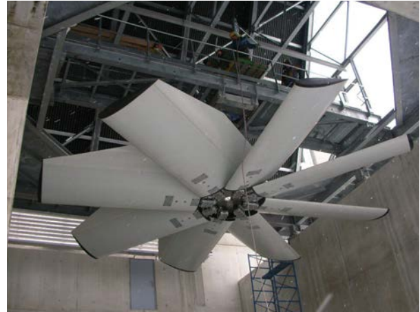
Air-cooled condenser service