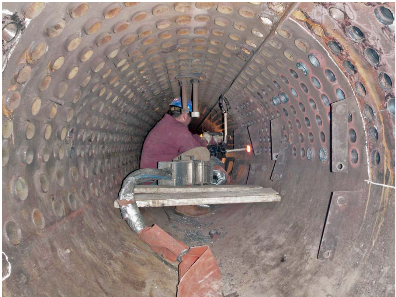
B&W's induction heat tube extraction processes reduce project cost and schedule, improve quality and reduce risk exposure.

The processes are safe, clean and eliminate the risk of tube seat and ligament damage often caused by the traditional tube removal methods of carbon arc air gouging or acetylene flame cutting, reducing or eliminating the need for subsequent drum shell repairs.