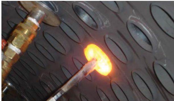
Induction heating permits the selective, rapid, concentrated, local heating of metal without damaging the tube seat or affecting the surrounding material grain structure.

The induction hardware consists of a high frequency power unit, an induction heating coil, an output-matching transformer, a remote on-off switch, interconnecting coaxial cables and cooling water hoses, and an auxiliary water cooling unit.