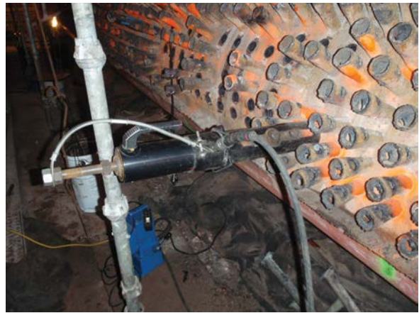
The patented induction heating technology has been proven on utility and industrial boilers throughout North America since 2004.