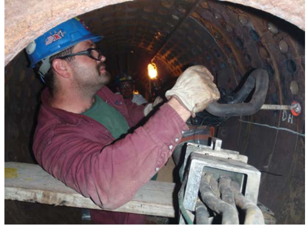
Using induction heat, fumes, sparks, molten metal, and fire are no longer threats to safety and productivity and the ventilation requirements associated with these environments are eliminated.

The Heat and Pull method was developed for the removal of previously heavily over-expanded tube stubs from headers and drums. Hydraulic jacking from outside the drum takes place while the tube stubs are inductively heated from inside the drum. Prior bell removal is not required, as the bell collapses and is pulled through with the stub. This one-step process has become widely acceptable for removal of tube stubs from all drums with seating rings in the tube seats.