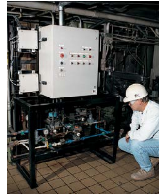
A standard valve rack with control panel is factory wired and tested to reduce installation time and cost. This valve rack can be conveniently located anywhere near the burner front.

B&W will design an FPS igniter system to meet your needs for start-up reliability, discriminative flame detection and lower opacity. A typical FPS oil igniter system in a coal-fired boiler is illustrated above with in-line valving.