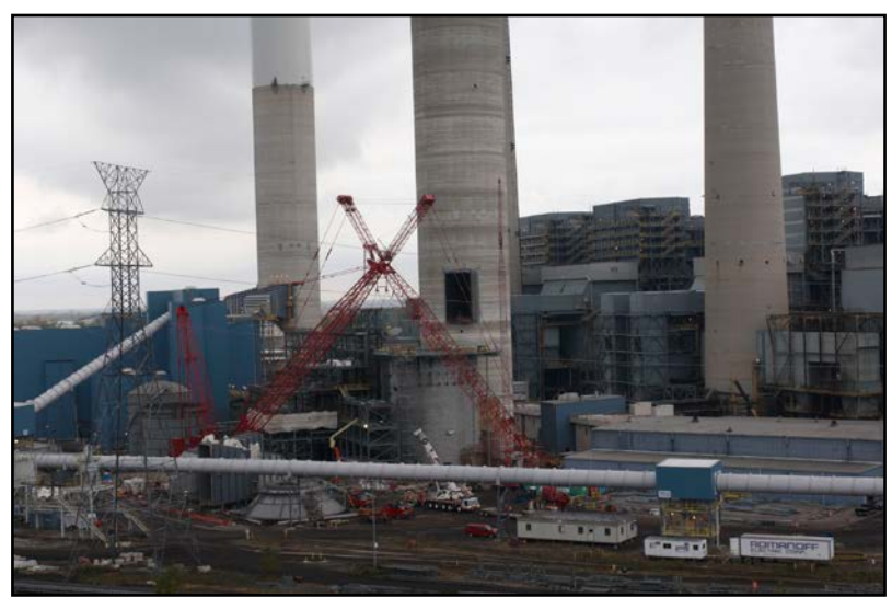
BWCC provided construction services for all B&W-supplied wet FGD system equipment at the Monroe power plant.