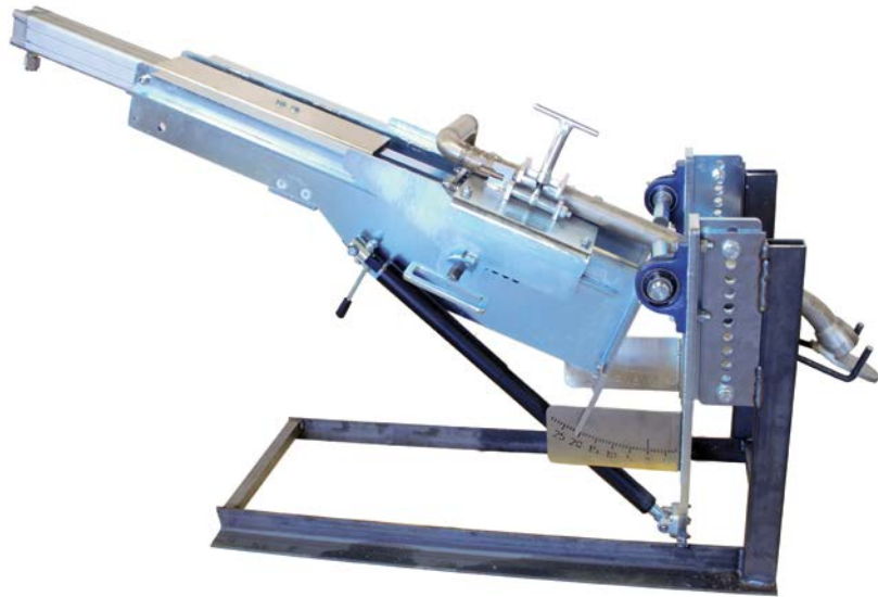
The Diamond Power SprayRod-R Dual Rail retractable, automatic liquor gun cleaner optimizes black liquor delivery into recovery boilers.