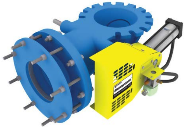
A-S-H Advantage Series 8 in. (203 mm) material handling valve

They are available for lateral feed vacuum conveying systems and as a direct replacement for UCC® Tiger™ valves. For more information on the Advantage Series material handling valve or on our other ash handling and performance solutions, contact your local B&W representative, or call 1-888-ASH-PARTS (1-888-274-7278).