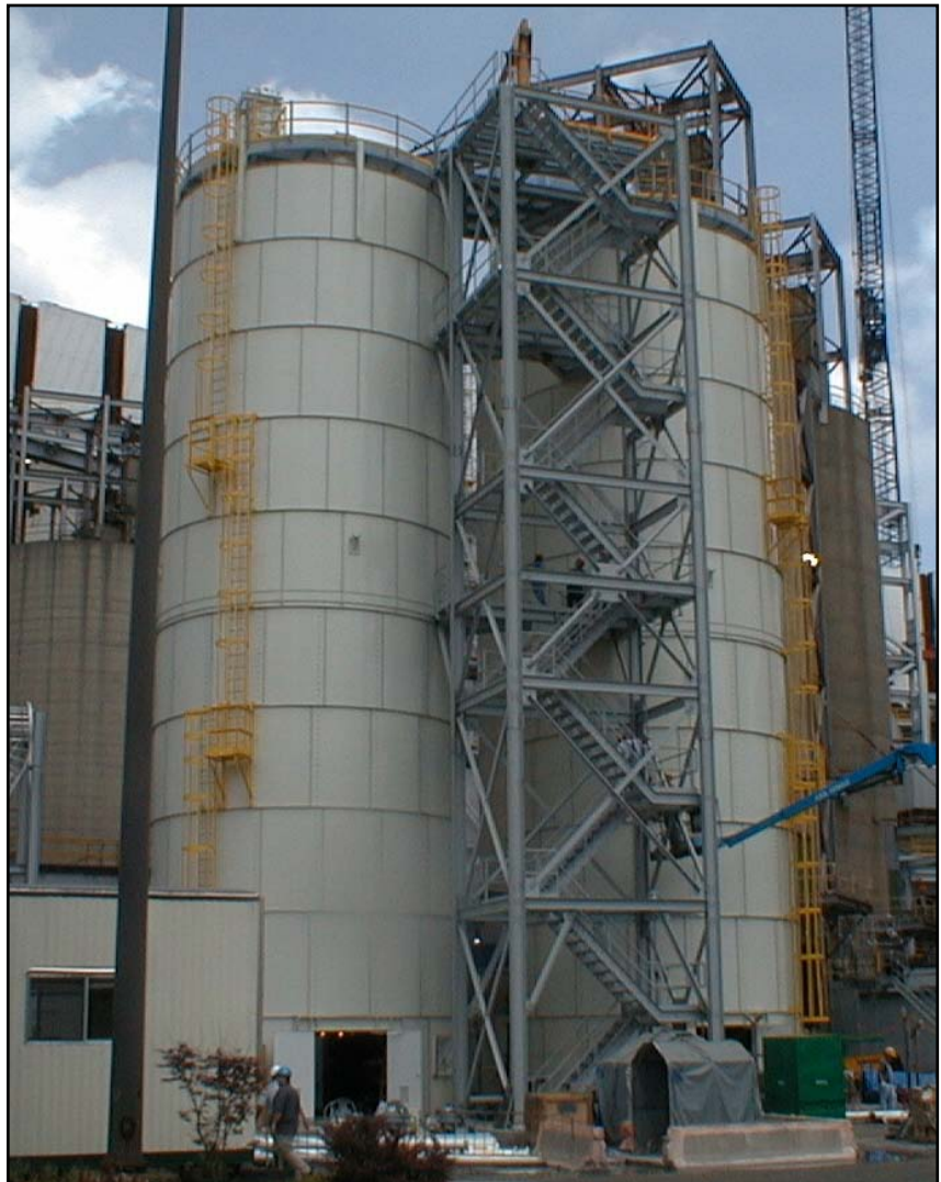
B&W PGG's dry sorbent injection systems provide a low-cost solution to address all acid gas emissions.

impact that existing emissions control equipment would have on a DSI system. Performance guarantees offered are a result of our field experiences coupled with pilot plant studies to understand the complex reactions of competing acid gases. As part of our complete line of multi-pollutant control technologies, our dry sorbent injection systems provide a low-cost solution to address all acid gas emissions.