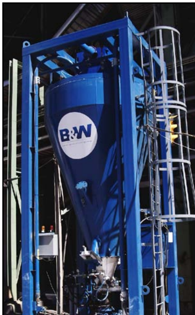
Field demonstrations are available with B&W PGG's mobile test unit.