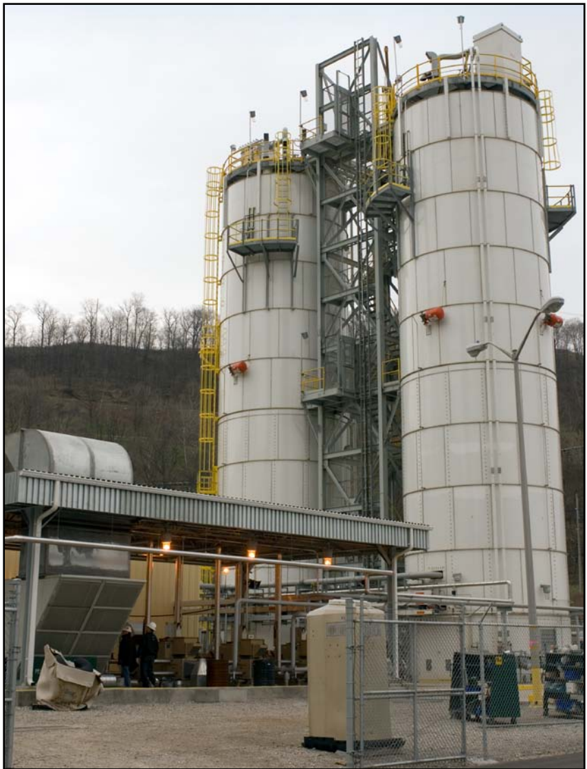
B&W PGG's total system approach examines the effects of sorbent injection on the entire air quality control system.