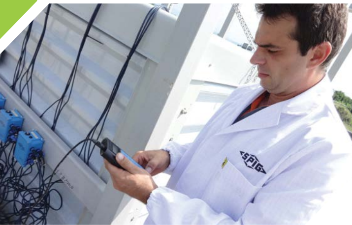
Continuous monitoring with the UNICO system provides plant personnel with important real-time operating data, enabling them to make performance-enhancing operational decisions.

SPIG S.p.A. (B&W SPIG) has always been committed to providing high quality products and outstanding service.