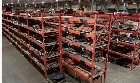
Our Assured Stock Program® inventory management system supports customer's safety stock levels, emergency requirements, and parts manufacturing based on forecasted needs.