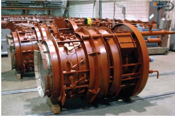
Used with an overfire air system, B&W's AireJet burner provides the ultimate solution for low NO x emissions.

The AireJet burner is just one example of B&W providing the best available low NO x technology to the power and steam generation industry. For more information about the AireJet burner or our complete line of emissions reduction systems, contact your nearest B&W sales or service office.