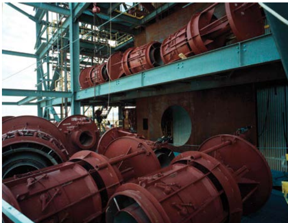
The DRB-4Z burner remains B&W's lowest NO x burner in applications without overfire air systems or where existing boiler geometry is not suitable for use of the AireJet burner.