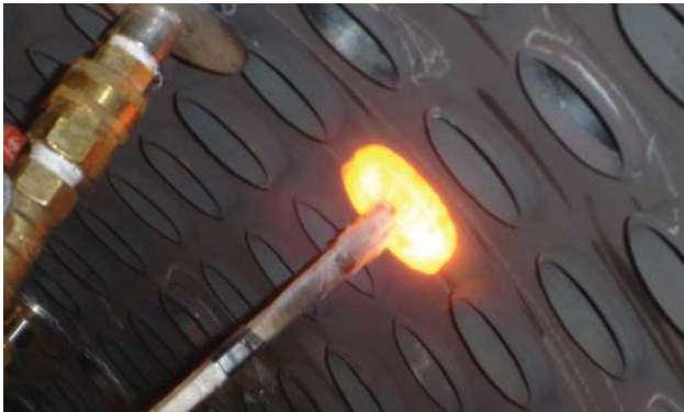
Induction heating permits the selective, rapid, concentrated, local heating of metal without damaging the tube seat or affecting the surrounding material grain structure.

The induction hardware consists of a high frequency power unit, an induction heating coil, an output-matching transformer, a remote on-off switch, interconnecting coaxial cables and cooling water hoses, and an auxiliary water cooling unit.