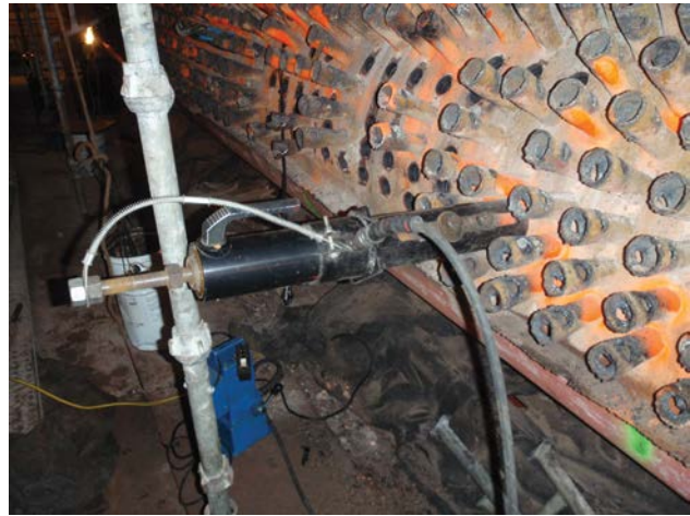
The patented induction heating technology has been proven on utility and industrial boilers throughout North America since 2004.