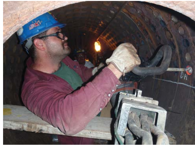
Using induction heat, fumes, sparks, molten metal, and fire are no longer threats to safety and productivity and the ventilation requirements associated with these environments are eliminated.

The Heat and Pull method was developed for the removal of previously heavily over-expanded tube stubs from headers and drums. Hydraulic jacking from outside the drum takes place while the tube stubs are inductively heated from inside the drum. Prior bell removal is not required, as the bell collapses and is pulled through with the stub. This one-step process has become widely acceptable for removal of tube stubs from all drums with seating rings in the tube seats.