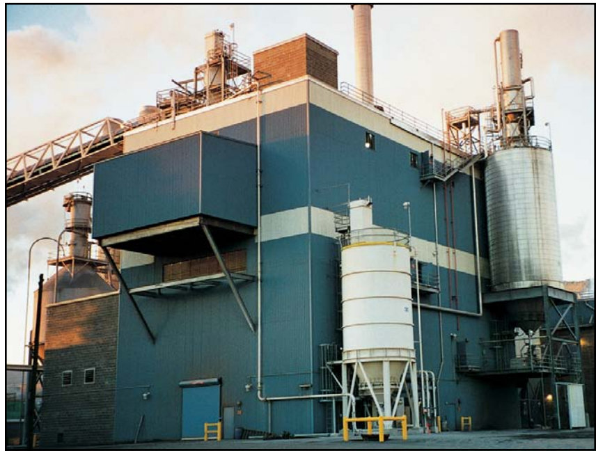
This BFB unit is now burning 100% of the sludge produced at the mill and is operating 25% above the original rated capacity.

ground-assembled in two major sub-assemblies, then lifted into place on successive days. The mill continued to run at full capacity throughout boiler installation.