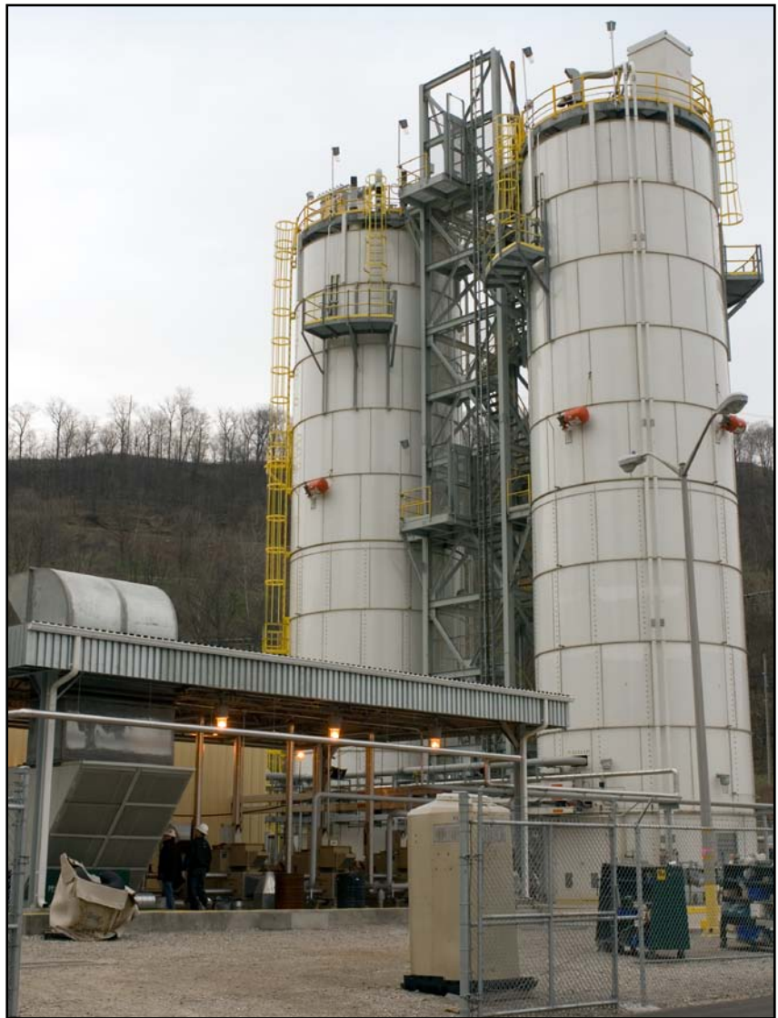
B&W PGG's total system approach examines the effects of sorbent injection on the entire air quality control system.