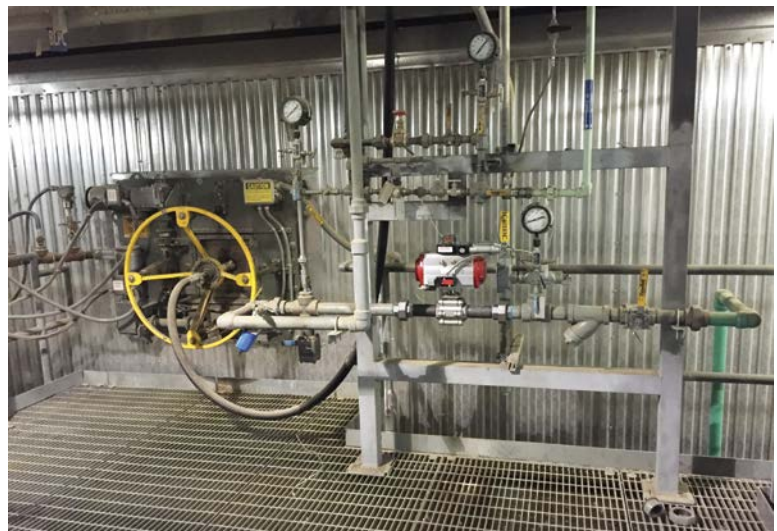
The Diamond Power HydroJet water cleaning system with associated valves and plumbing assembly features a compact design for easy access.