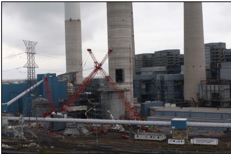
BWCC provided construction services for all B&W-supplied wet FGD system equipment at the Monroe power plant.