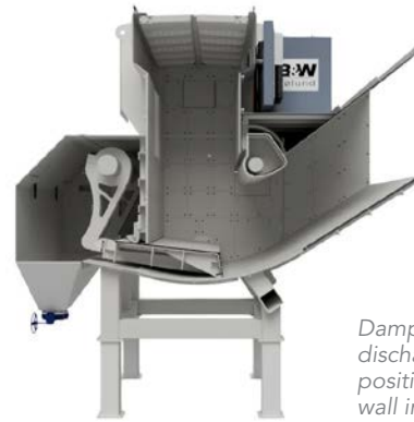
Dampers in closed position; discharge ram in forward position; retractable shear wall in raised position.