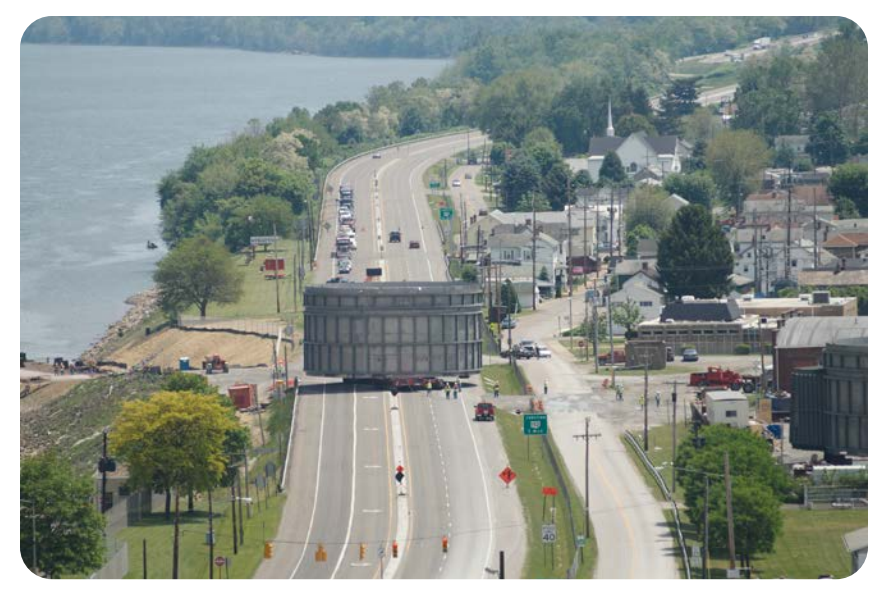
Wet FGD module crossing highway from barge unloading.

• Extensive three-dimensional modeling was used to design the new SCR reactor; structural support steel; connecting flues; ammonia vaporization, dilution and injection equipment; and other auxiliary equipment within the space previously occupied by the abandoned ESP. The SCR design and