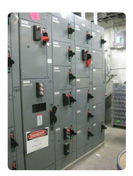
SCR motor control centers.