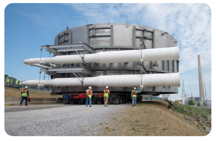
Wet FGD module on transporter moving to plant for installation.