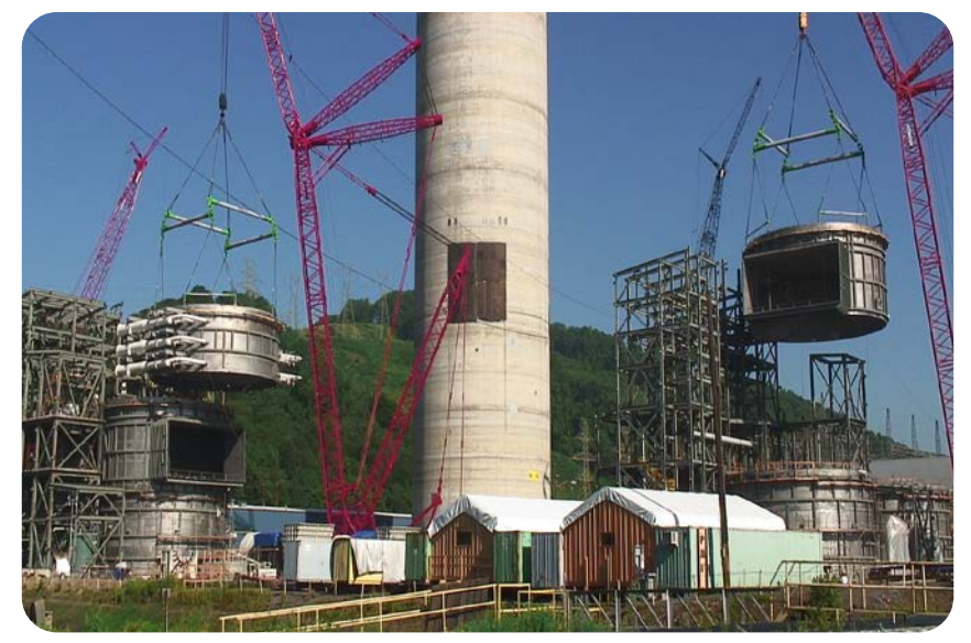
Dual wet FGD lift, June 2008.