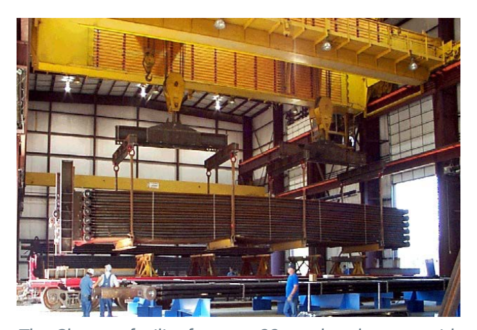
The Chanute facility features 22 overhead cranes with capacities up to 200 tons and 35-foot hook heights.