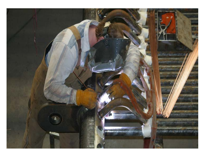
The B&W Chanute manufacturing facilities are ASME certified to Section I – Power Boilers, Section VIII – Pressure Vessels, and ANSI/ASME B31.1 – Power Piping. We hold "S", "U", "PP" and "R" stamps.

Our goal has always been to provide quality workmanship with a commitment to integrity and customer satisfaction. In addition to HRSG component fabrication, our capabilities include manufacturing a wide range of specialty boilers, steam generation pressure parts, and related industrial products. We also manufacture a wide range of heat transfer equipment and components on a contract basis.