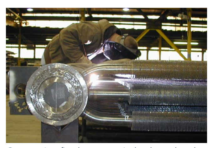
Our premium fintubes are meticulously produced to exact customer specifications for exceptional fit, functionality and reliability.