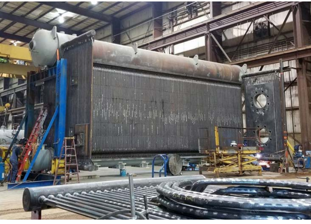
We have package boiler manufacturing experience utilizing a variety of materials and casing construction including internally insulated and lined, refractory lined and membrane wall construction.