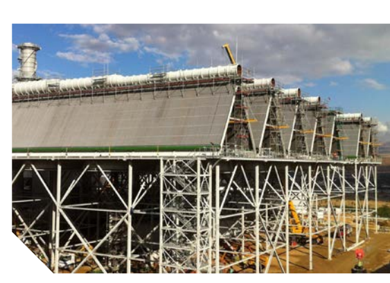
B&W's UNICO system analyzes critical operating performance data on virtually any wet or dry cooling system.