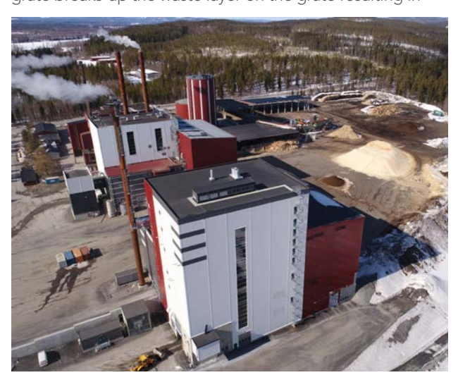
B&W has supplied three units for Boden. The most recent line is shown in the foreground.

With this grate, plant operation is not interrupted by melting metals, thereby increasing operational uptime. The mechanical wave movement of the DynaGrate combustion grate breaks-up the waste layer on the grate resulting in