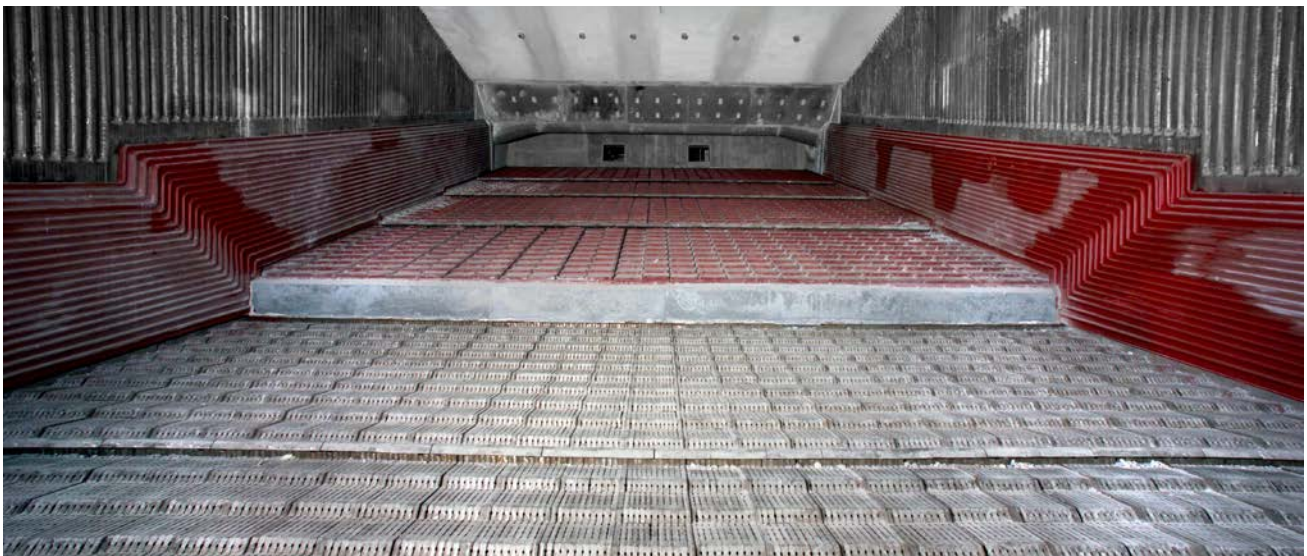
The combustion grate and burn-out grate are integrated into one unit and all sections are operated and controlled individually, resulting in highly efficient combustion.