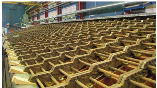
The Vølund grate is manufactured in Denmark and also under license in China and Korea.

Individual components used in the grate design are specially developed for highly variable loads and high temperatures. The result is high reliability with minimal downtime.