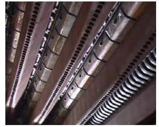
Underside views of grate.