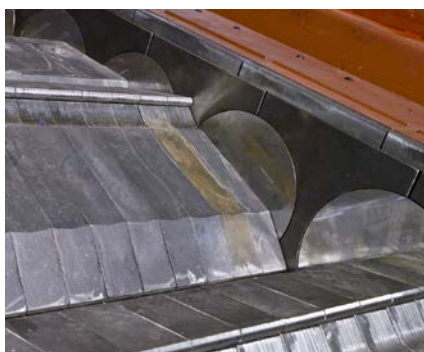
The unique design and movement of the DynaGrate combustion grate minimizes maintenance and optimizes fuel burnout.