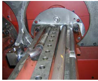
Water-cooled DynaGrate with cooling integrated in shaft.