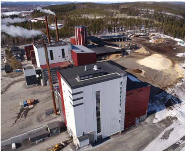
B&W has supplied three units for Boden. The most recent line is shown in the foreground.

With this grate, plant operation is not interrupted by melting metals, thereby increasing operational uptime. The mechanical wave movement of the DynaGrate combustion grate breaks-up the waste layer on the grate resulting in