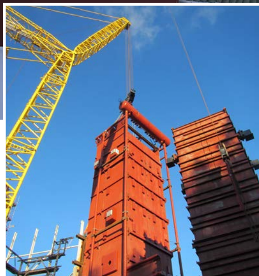
The modularized boiler is being lifted into place.

In 1995, the first Vølund™ waste-to-energy line was commissioned at Boden in northern Sweden. A second Vølund grate line was built in 2008. In December 2016, municipal-owned Boden Energi AB awarded Babcock & Wilcox Renewable (B&W) the contract for a third Vølund line (Boiler 18), this time with a DynaGrate® combustion grate. The two previous lines are still operational.