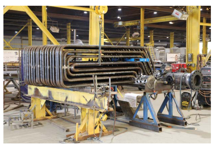
Our quality fabrication options include both domestic and international manufacturing capabilities to adapt critical project needs, such as lead time or lower cost, to supply the optimal solution.