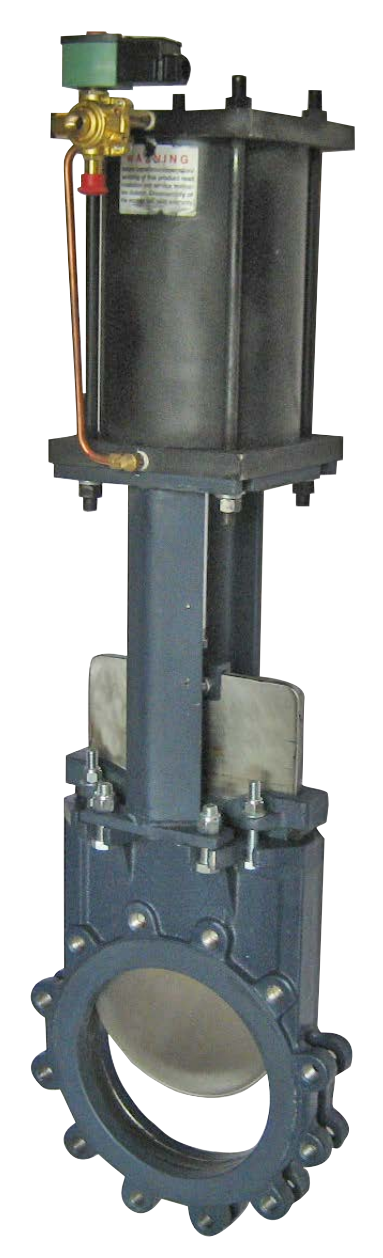
Unique bi-directional shutoff for superior, leak-free system performance

The ASHFLO valve design has no grooves or cavities in the bottom of the valve to accumulate settled material. No accumulation between the gate and seal allows for proper gate closure every time.