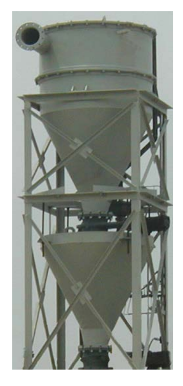
The CycloASH 60 collector is available for silo installation in vacuum conveying