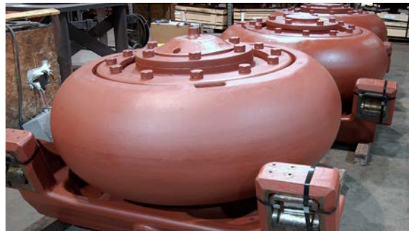
A wide range of remanufacturing services are available at B&W's service centers to meet your specific needs while minimizing lead times and costs.

To help maintain high availability and maximum service life from your equipment, we offer comprehensive rebuild and upgrade programs for a wide range of components. Our rebuild process includes evaluation for possible reconditioning and reuse of existing components, and all parts are inspected to B&W's exacting OEM specifications.