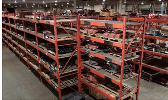
Our Assured Stock Program® inventory management system supports customer's safety stock levels, emergency requirements, and parts manufacturing based on forecasted needs.