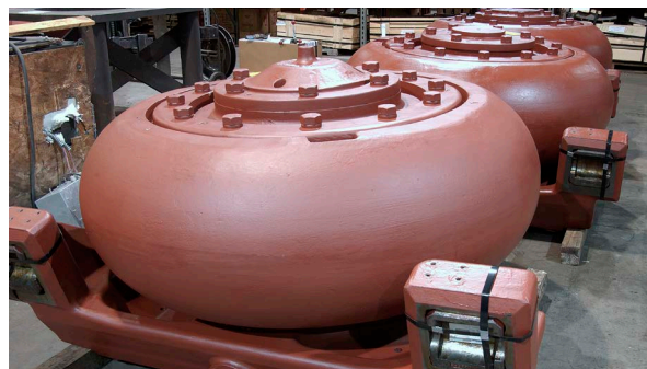
A wide range of remanufacturing services are available at B&W's service centers to meet your specific needs while minimizing lead times and costs.

To help maintain high availability and maximum service life from your equipment, we offer comprehensive rebuild and upgrade programs for a wide range of components. Our rebuild process includes evaluation for possible reconditioning and reuse of existing components, and all parts are inspected to B&W's exacting OEM specifications.