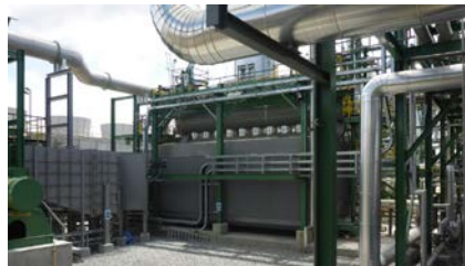
Industrial water-tube boiler

B&W's BrightGen™ hydrogen combustion technology produces no CO 2 and is commercially ready and currently in operation worldwide. In fact, we have more than 60 industrial water-tube package boilers firing hydrogen and hydrogen-blended fuels. BrightGen technology can be retrofit onto existing equipment or provided with new installations to fire hydrogen efficiently and safely.