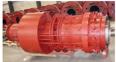
Oxy-fuel combustion burner