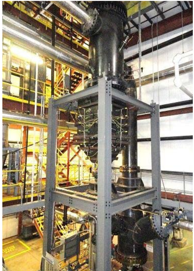
250 kW t fuel direct chemical looping test unit

B&W concluded that given the success of the 250 kW t pilot units for application to hydrogen and steam for power generation, we are ready to demonstrate the technology at a larger scale. B&W is proposing a project to demonstrate steam and hydrogen production and to be rated at a thermal input of between 2.5 and 25 MW t while utilizing the most applicable fuel feedstock.