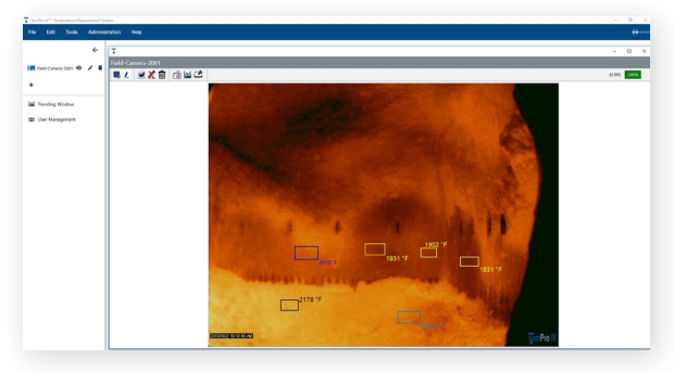
State-of-the-art technology for monitoring recovery bed or utility profiles and firing conditions