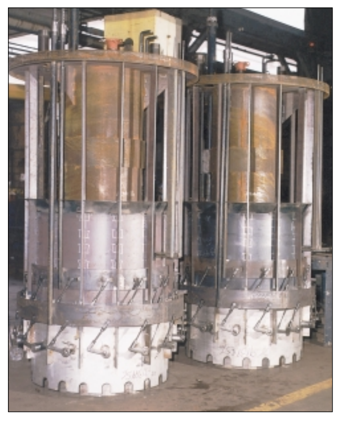
Like all B&W combustion equipment, the parts exposed to the radiant furnace heat are constructed of high temperature alloy material (bottom of photo) ensuring long life and durability.