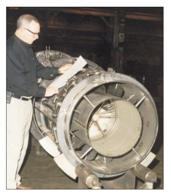
B&W's overfire air equipment is based upon the same rugged mechanical features as the DRB-4Z low NO_x burner. Our leadership in the field of NO_x reduction technology began in 1962 with the first patented overfire air port design. We have sold more than 21,000 MW of overfire air systems.