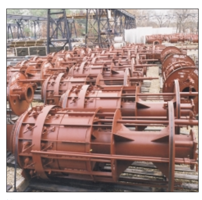
Through extensive research, B&W continues to develop innovative improvements in ultra low NO_x combustion technology. B&W has the engineering, manufacturing and project management experience to achieve optimum combustion and post-combustion system solutions. Contact your regional B&W sales office for more information on the DRB-4Z ultra low NO_x burner.