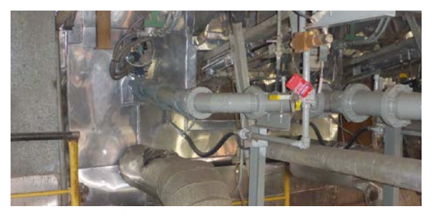
New pneumatic limestone injection system.

A dry sorbent injection (DSI) system was also added to the unit upstream of the ESP. While the limestone injection system achieved the required SO<sub>x</sub> emission limit for the unit, the DSI system was added for additional SO<sub>x</sub> reduction capability to eliminate the need for SO<sub>x</sub> capture systems elsewhere at the refinery.