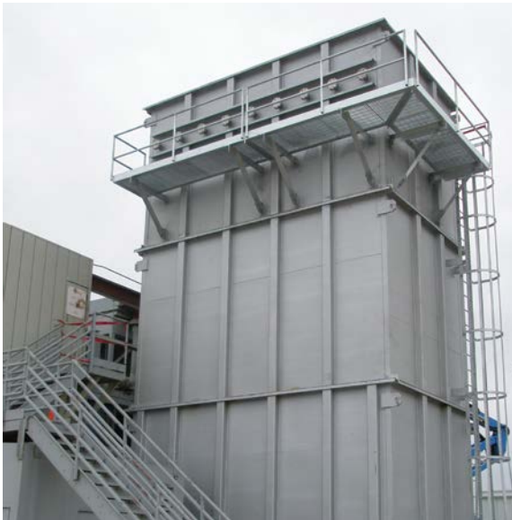
B&W Universal designed and manufactured this exhaust system for a Westinghouse 251 gas turbine