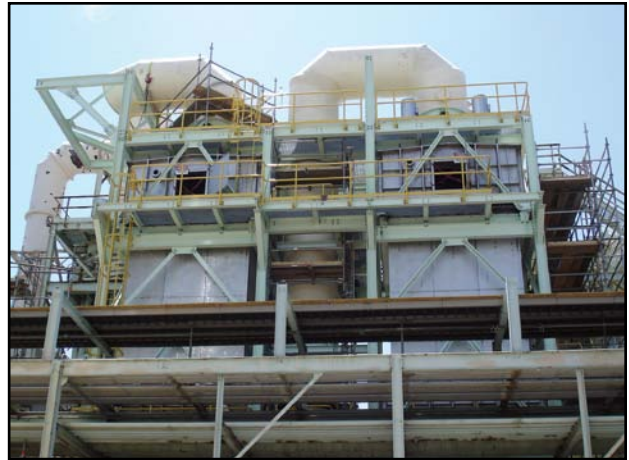
B&W alloy wet ESP replacement for lead acid mist units.