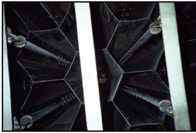
The hexagonal gas passage design allows for a more compact unit configuration and lower pressure drop.

Each gas passage contains a rigid discharge electrode. A four-point suspension of these rigid discharge electrodes allows for reliable means of inter-electrode alignment. The self-supporting nature of the electrodes eliminates the need for any bottom mounted support insulators to maintain alignment. Fine particulates and sulfuric acid mist droplets contained in the gas will receive a negative electric charge from the high voltage electrodes and will migrate and collect onto the positively grounded collecting surfaces.