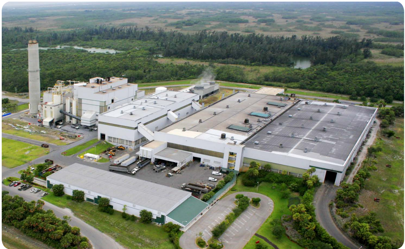
PBREF No.1 peacefully coexists with the SWA Conservation Area and Rookery, a wildlife preserve that provides more than 300 acres of wetland habitat.

B&W PGG also refurbished the two Stirling® power boilers at the facility by designing, supplying and fabricating critical boiler components including furnaces, superheaters, generating bank, economizer, air heater, combustion systems and steam drum internals.