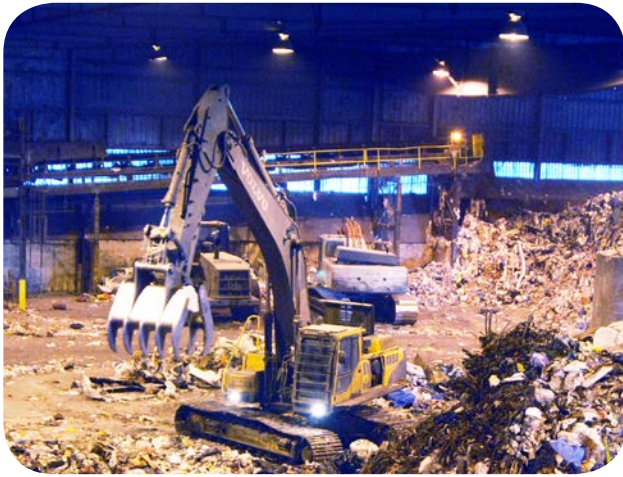
During its first 20-year operating period, PBREF No. 1 processed nearly 16 million tons of municipal solid waste, generated 6.9 billion kilowatts of net electrical output, and recovered more than 664,000 tons of ferrous metals and nearly 63,000 tons of nonferrous metals.

The furnace and combustion system of PBREF No. 1 incorporates a straight-walled furnace design with state-of-the-art PrecisionJet® overfire air system. The plant also features state-of-the-art emissions control equipment including dry scrubbers for acid gas control, fabric filters for particulate control, selective noncatalytic reduction (SNCR) system for nitrogen oxides (NO x ) control, and activated carbon injection for mercury control. This equipment makes PBREF No. 1 one of the cleanest WTE facilities in the United States.