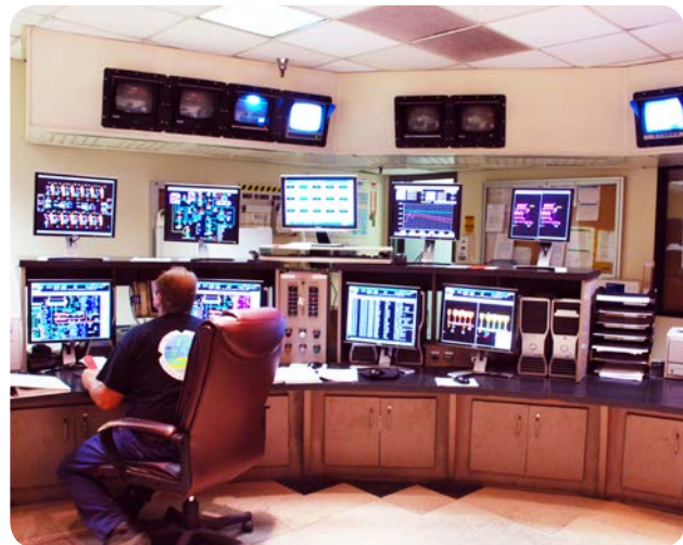
Based on a successful 20-year operating history, SWA extended PBRRC's operations and management contract for an additional 20 years, through 2029.