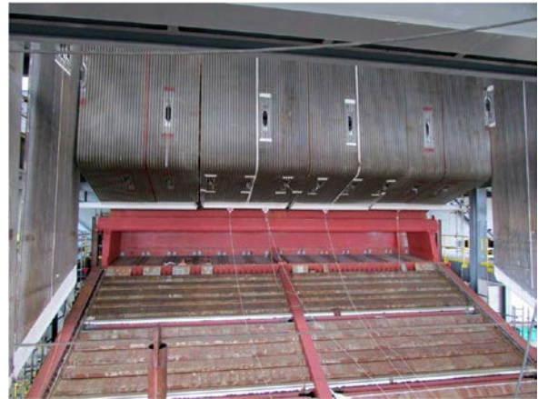
A view inside the furnace shows the fuel ram feeder, B&W Vølund DynaGrate® traveling grate combustion system, and weld overlay for lower furnace tube corrosion protection.

to be recovered for resale on the scrap metal market. The remaining ash is collected in bunkers where it is loaded onto trucks for transporting to a landfill.