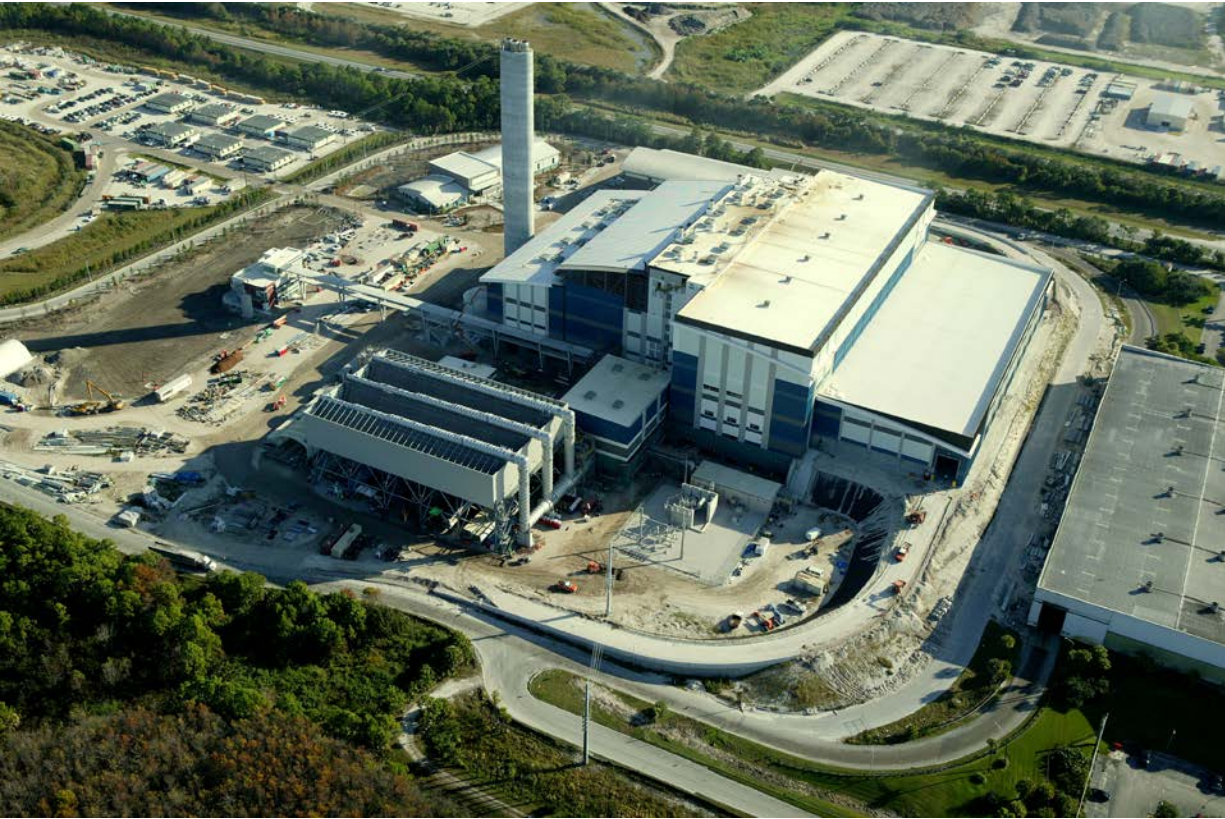
The state-of-the-art PBREF No. 2 waste-to-energy facility features three B&W boilers and associated emissions control equipment, making it one of the cleanest renewable energy facilities in the United States.