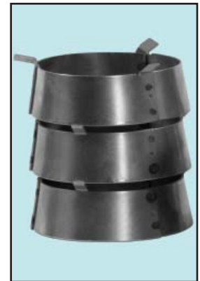
Tricone device provides improved fine particle collection.