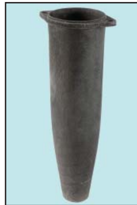
Cast iron collecting tube for long wear. NiHard is available for high wear applications.