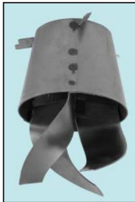
Spirocone energy recovery device for 9 in. Multiclone collectors.

Phone: 1.800.BABCOCK, Option 2 Fax: 330.860.9202 Email: environmentalparts@babcock.com