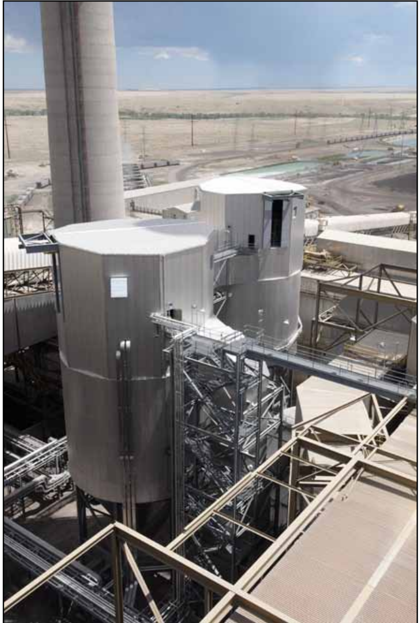
The unique flue gas dispersion system, coupled with the reliable atomizer, allows optimal gas and reagent mixing for high SO 2 removal efficiencies.