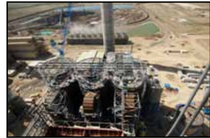
BWCC, a B&W PGG subsidiary, provided construction services for all B&W PGG-supplied air quality control system equipment and structural steel.