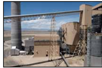
Unit 3 SDAs and pulse jet fabric filter.

The project met every engineering, fabrication and construction schedule milestone. The commissioned units are currently meeting all performance guarantees.