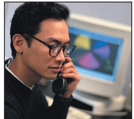
Skilled technical support representatives offer superior customer service 24 hours a day, 7 days a week.