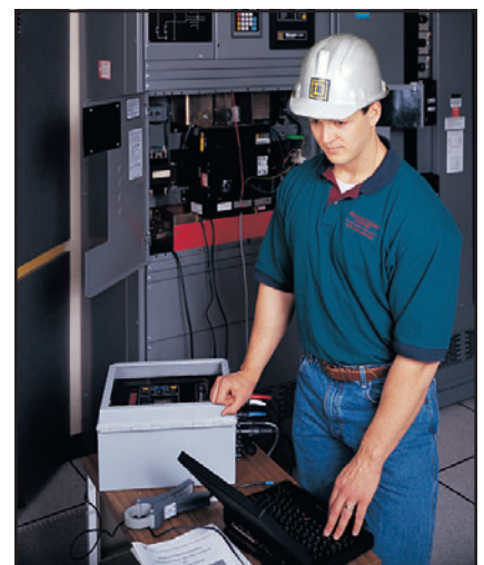
Our professional engineers are on the leading edge of electrical equipment technology and are leaders on several IEEE power quality standard committees.