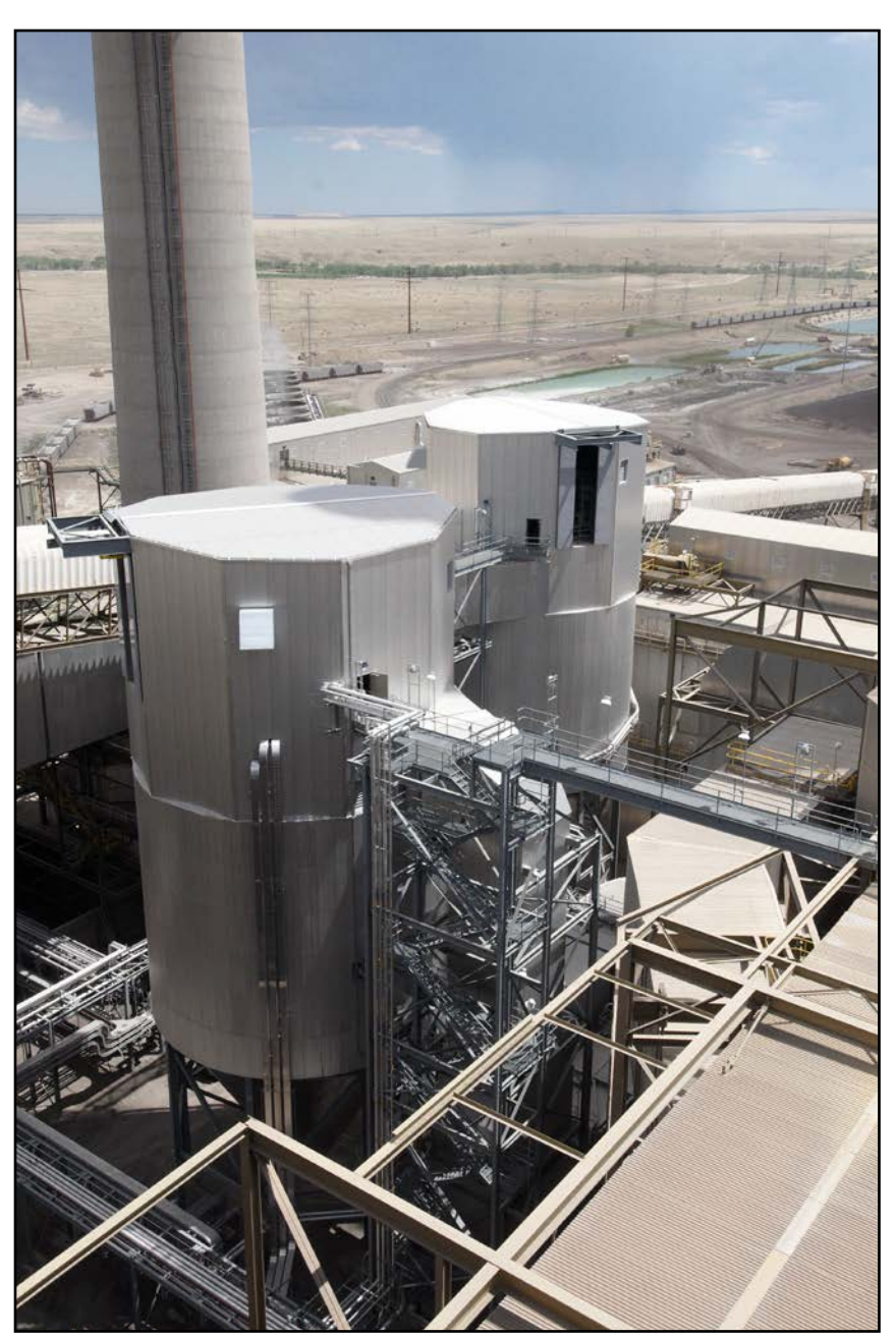
The unique flue gas dispersion system, coupled with the reliable atomizer, allows optimal gas and reagent mixing for high SO_2 removal efficiencies.

• Design fuel: Powder River Basin (PRB) subbituminous