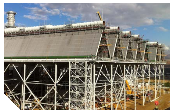
B&W's UNICO system analyzes critical operating performance data on virtually any wet or dry cooling system.