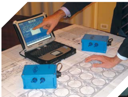
By presenting web-based data, the UNICO system's key performance indicators are remotely available anywhere in the world with Internet access.

The UNICO online monitoring system is based on a network of localized smart units that collect data, converts the information into digital form, and transmits to a supervisory system using wireless technology. The supervisory system validates and integrates the data in a single database. The system processes the acquired information to check process parameters, variability and equipment reliability. It also detects potential problems, generates alarms and determines counteractions which can help prevent loss of plant performance.