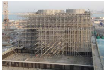
22-cell cooling tower under construction in Qatar