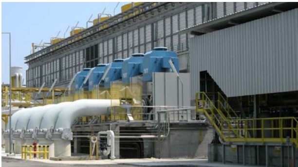
Hybrid pre-cast RCC installation in Italy

B&W's environmentally sound wet/dry technology avoids the environmental impact of coupling a wet cooling tower and a dry section (air-cooled heat exchangers) producing dry and hot air.