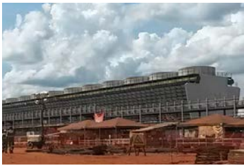
Crossflow FRP installation in Brazil