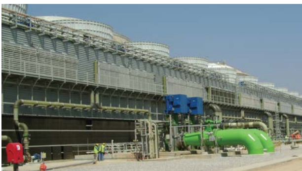
Seawater cooling tower at a 2 x 425 MW combined cycle plant

Environmental standards now require that the process water is cooled before discharging to the sea to avoid thermal shock to marine life. B&W has executed many successful sea water cooling applications ranging from power plants, petrochemical facilities, smelting complexes, etc.