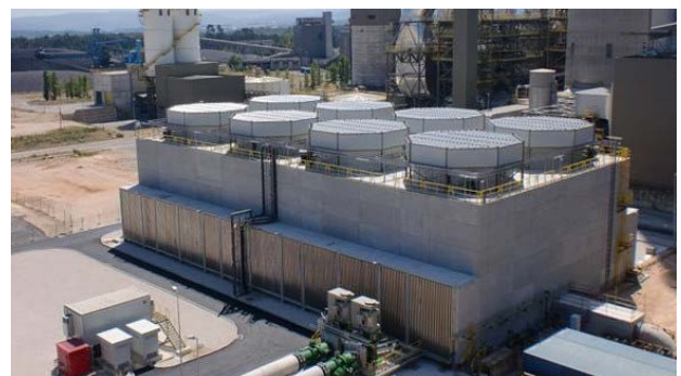
Noise-abated cooling towers

Additional noise control solutions may be specified, including inlet or outlet silencers, or sound proofing boxes to encapsulate the motors. We have extensive experience with such customized solutions with many successfully operating systems throughout the world.