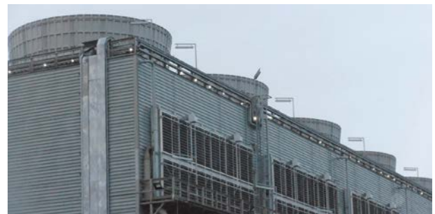
Wooden hybrid installation in the UK

When using sea water as make up, material selection is very important. B&W uses corrosion-free plastic for the cooling tower structure and the main internal components, and the mechanical equipment is protected with suitable coatings to provide the highest degree of protection for salt water applications.