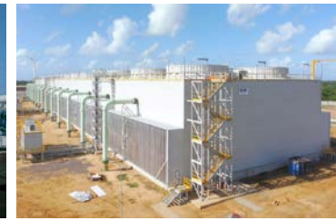
Low noise FRP cooling tower