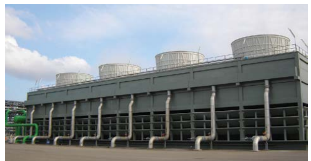
Concrete cooling towers

The shell and structure is designed to resist wind loads as requested by local codes and standards. It can also be designed to resist seismic loads if required at the plant location. Calculations consider the dead and live loads of the complex while running at full capacity.