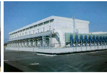
Pre-cast concrete cooling tower