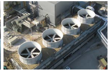
Wooden cooling tower for a power plant