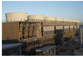
Hybrid wet/dry cooling tower