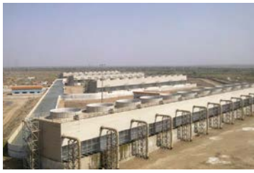
Power plant in India