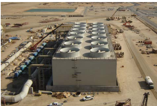
FRP cooling towers at a refining and petrochem facility in Saudi Arabia

FRP cooling towers have gained acceptance as a smart alternative to wood, concrete or aluminum thanks to its outstanding properties. FRP cooling tower structures consist of a frame work made by structural shapes of fiberglass composite, stiffened with diagonal braces to transfer wind, earthquake and other live loads to the basin. A large area of the fan deck is walkable and designed to allow easy maintenance of the tower, accessible from ground level via stair/ladder and completely surrounded by handrails.