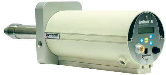
The GASTEMP XT optical pyrometer provides absolute temperature data.

Because the GASTEMP XT optical pyrometer is so reliable, durable and portable, it can be used as a field diagnostic tool or as a permanent installation. For diagnostics, use it as a stand-alone instrument or with data acquisition equipment to record data.