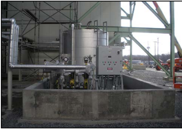
B&W can provide both delivered and erected (D&E) and turnkey mercury project solutions on new wet FGD installations or as stand-alone systems for existing wet scrubbers.

two injection points are installed, one serving as the primary feed point and the other(s) as backup if the first pump is taken out of service.