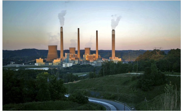
B&W was selected to inspect and refurbish ignition equipment at AEP's Amos Plant.

The plant features three supercritical, dry-bottom boilers powered by a blend of low-sulfur coal and Northern Appalachian Basin high-sulfur coal. Unit 3 was started up in October 1973 as the first 1,300 MW power plant in the United States.