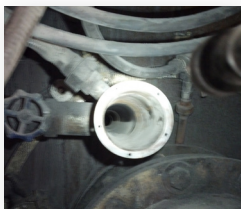
Holes in ignitors' stationary guide tubes prevented safe light-off of the unit.

For the inspection, we pulled the internal guide tube assemblies from the unit and noted significant fly ash pluggage — up to 80 percent in some of the tubing. Several holes were also found in the tube assemblies and in the stationary guide tubes. In addition, some of the eddy plates were bent and not made or positioned to OEM specification; spark rod assemblies were in poor condition; and locking cams that fasten the atomizers and the unit's oil and air connections were inoperable because of accumulated residue.